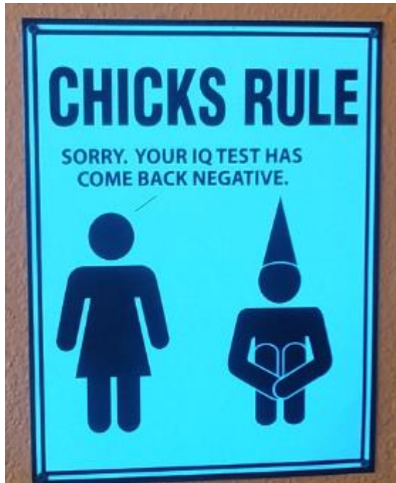
(Sign posted at Hae Ha Heng)